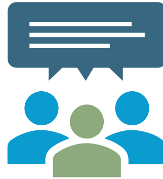
Project Management Teams