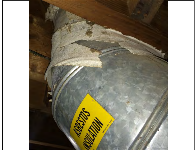
Photo 2: Asbestos-containing duct insulation tape observed to be in poor condition in the basement.