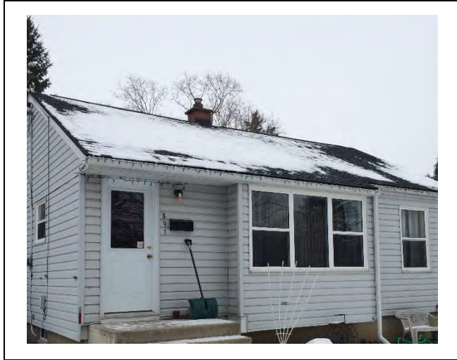
Photo 1: Presumed asbestos-containing brick mortar, roofing materials and roof caulking.

Appendix D Selected Site Photographs February 15, 2017