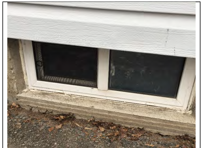
Photo 4: Presumed asbestos-containing exterior caulking – white was observed on the exterior window.