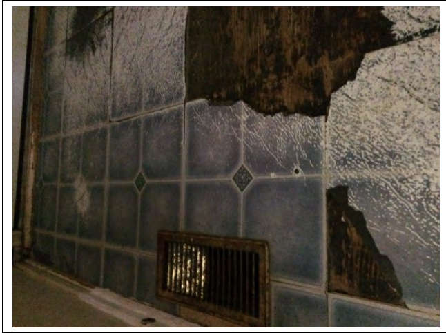
Photo 5: Asbestos-containing 12"x12" vinyl floor tile – beige with brown streaks was observed to be present under peel and stick tiles in the 1 st floor hallway in Unit L.

Appendix D Selected Site Photographs February 15, 2017