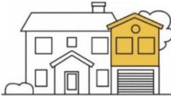
Over the Garage