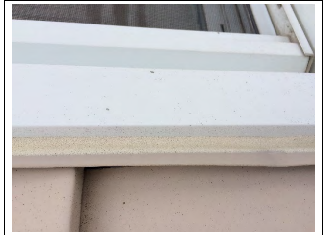
Photo 2: Presumed asbestos-containing exterior caulking – white on the exterior window.