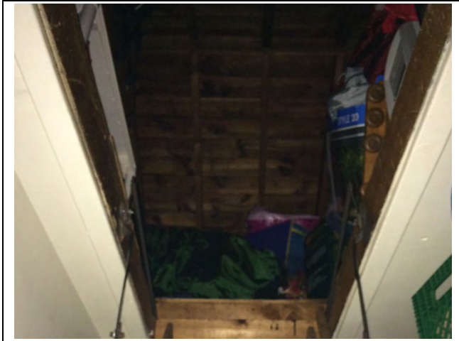
Photo 1: Asbestos-containing drywall joint-fill compound was observed to be in good condition on the walls and ceiling in the storage room access to the attic.

Appendix D Selected Site Photographs February 15, 2017