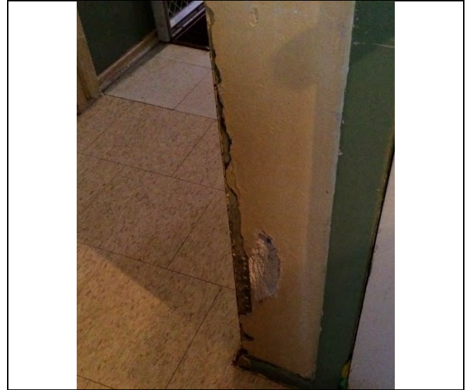
Photo 2: Asbestos-containing drywall joint-fill compound observed to be in poor condition on the kitchen wall at 574 Fort Town Drive.