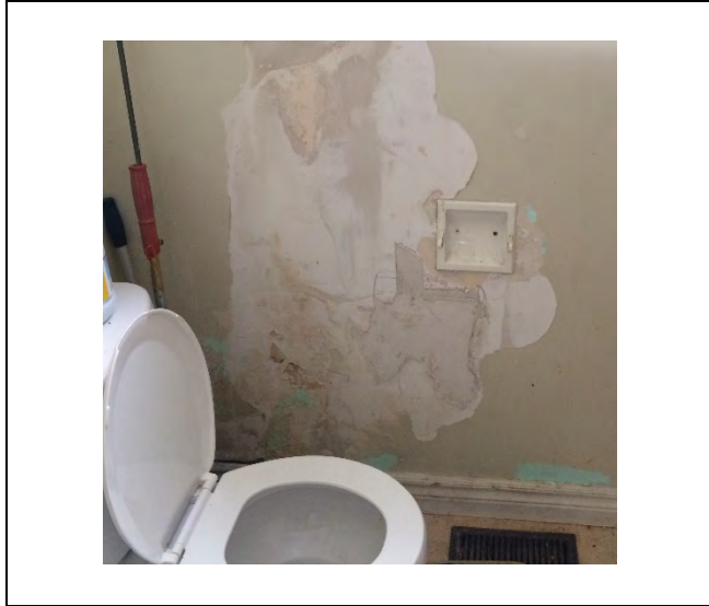
Photo 1: Asbestos-containing drywall joint-fill compound observed to be in poor condition on wall in the washroom at 555 Fort Town Drive.

Appendix D Selected Site Photographs February 17, 2017