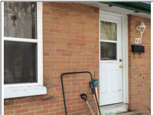
Photo 7: Presumed asbestos-containing exterior caulking – white observed on the exterior windows and doors at 518 Fort Town Drive.