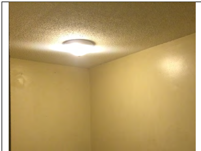
Photo 3: Asbestos-containing drywall joint-fill compound and stucco observed at 550 Fort Town Drive.