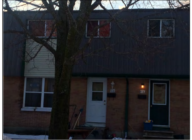
Photo 6: Presumed asbestos-containing brick mortar observed to be present on the exterior walls.