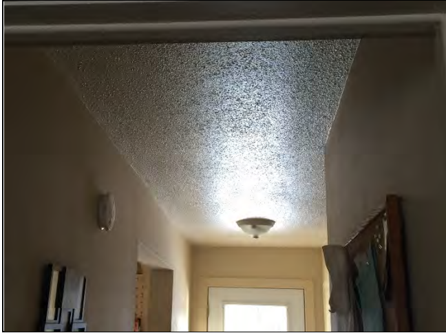
Photo 5: Asbestos-containing stucco and drywall joint-fill compound observed at 563 Fort Town Drive.

Appendix D Selected Site Photographs February 17, 2017