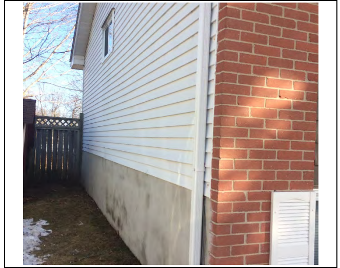
Photo 2: Presumed asbestos-containing brick mortar observed on front exterior wall.