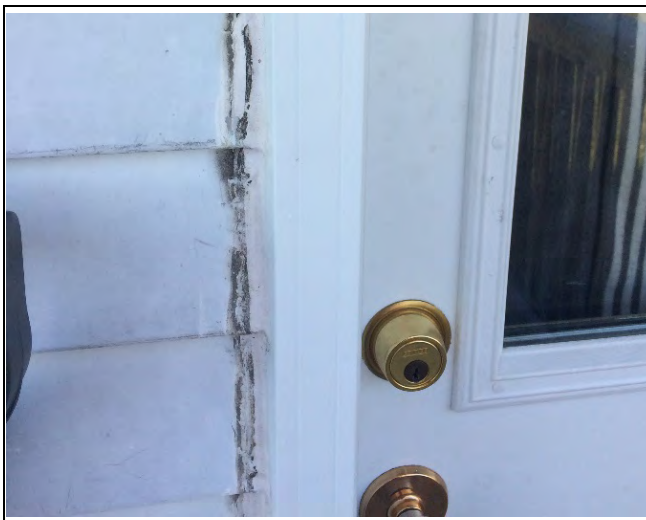
Photo 3: Presumed asbestos-containing exterior caulking – white observed on the back door.