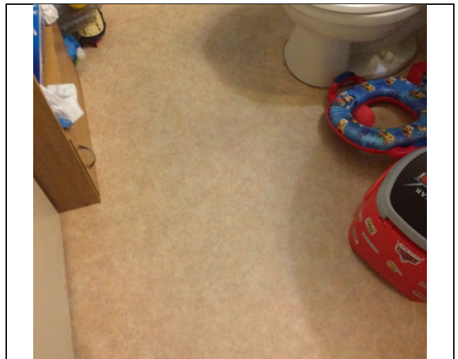
Photo 4: Vinyl sheet flooring on the washroom floor reported to be new and not suspected to be asbestos-containing.