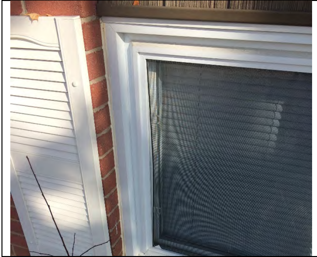
Photo 1: Presumed asbestos-containing exterior caulking – white observed at the front window.

Appendix D Selected Site Photographs February 15, 2017