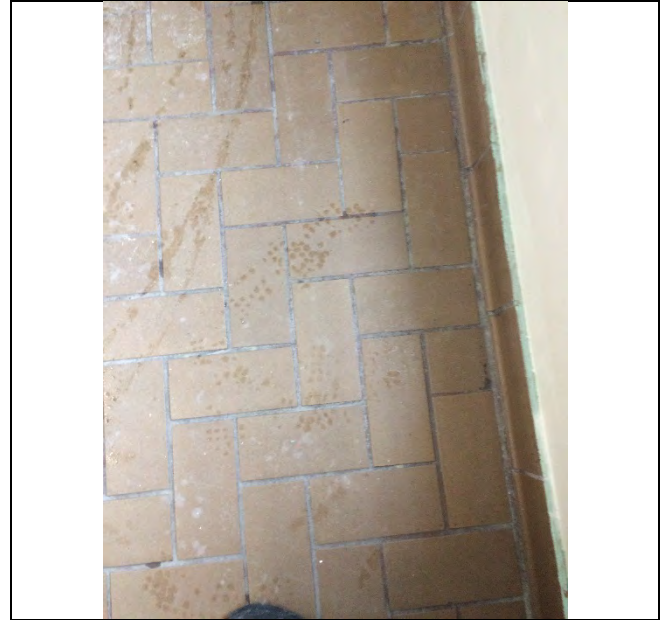
Photo 2: Presumed to be asbestos-containing ceramic tile grout and mortar/adhesive in the lobby.