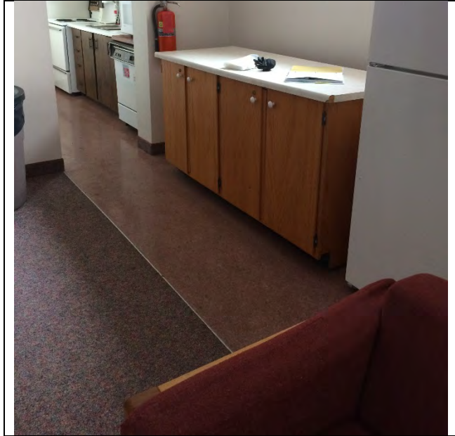
Photo 5: Presumed asbestos-containing mastic associated with 12"x12" vinyl floor tiles – pink mosaic pattern.

Appendix D Selected Site Photographs February 17, 2017