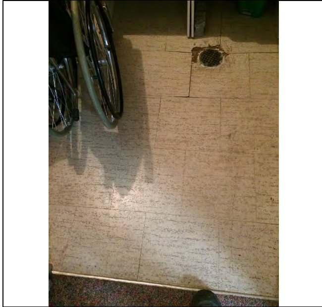
Photo 1: Asbestos-containing 12"x"12" vinyl floor tiles – white with dots was observed to be in poor condition (loose tile) in the storage room in the common room.

Appendix D Selected Site Photographs February 17, 2017