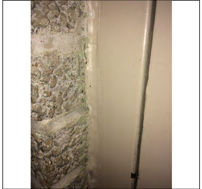
Photo 6: Presumed asbestos-containing brick mortar and exterior door caulking – white (under beige paint) at the back entrance near the elevator door.