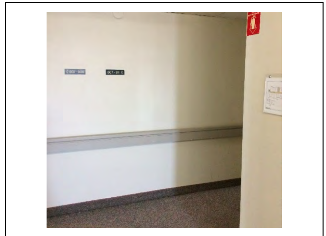
Photo 4: Asbestos-containing drywall joint-fill compound in the 8 th floor corridor near the elevator lobby.