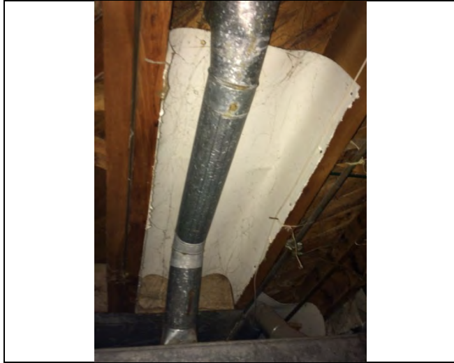
Photo 1: Asbestos-containing paper-like ducting insulation was observed to be in good condition in the basement.

Appendix D Selected Site Photographs February 15, 2017