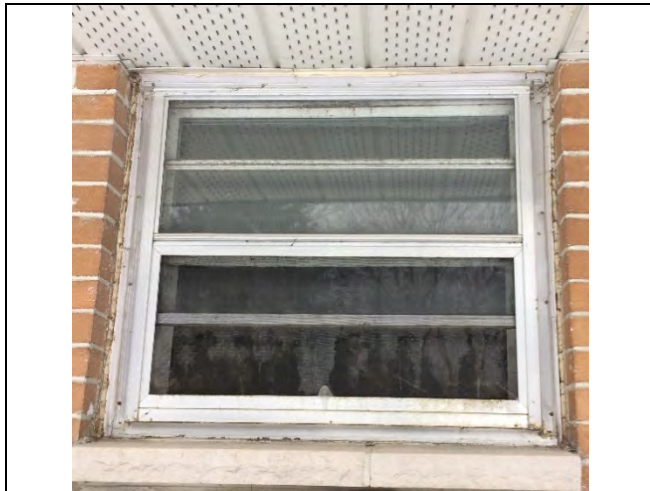
Photo 3: Presumed asbestos-containing exterior window caulking was observed on washroom window.