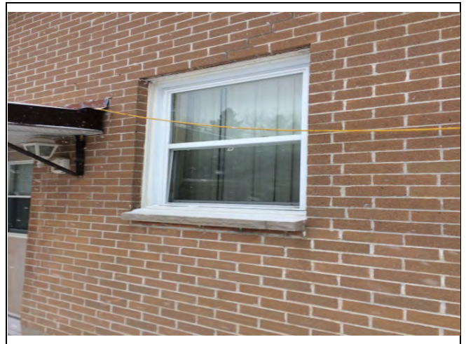
Photo 4: Presumed asbestos-containing brick mortar on exterior walls.