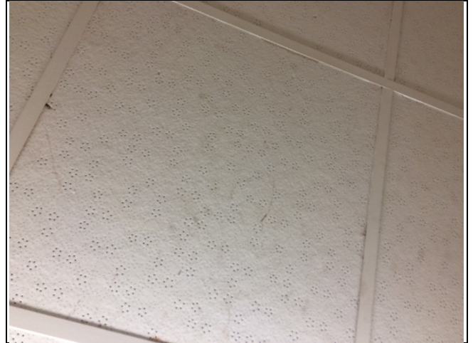
Photo 2: Asbestos-containing 2'x2' acoustic ceiling tile – large and small pinholes.