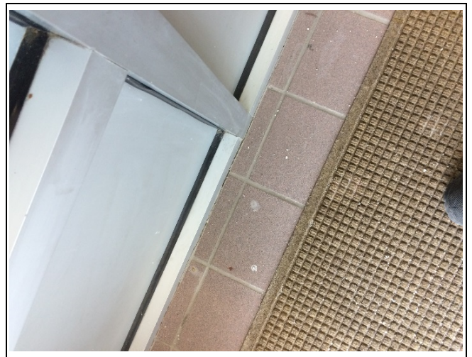
Photo 4: Presumed asbestos-containing ceramic tile grout and mortar/adhesive at the main entrance.