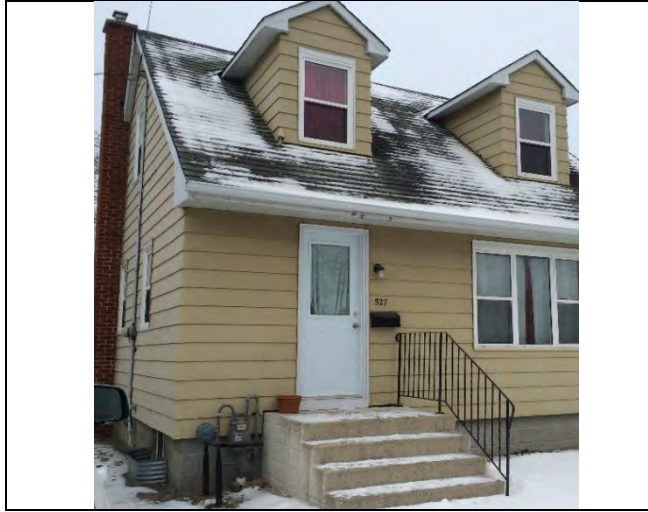
Photo 1: Presumed asbestos-containing roofing materials and roof caulking was observed to be present.

Appendix D Selected Site Photographs February 15, 2017