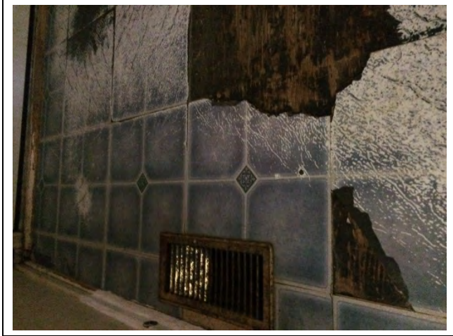
Photo 5: Asbestos-containing 12" x 12" vinyl floor tile – beige with brown streaks was observed to be present under peel and stick tiles in the 1 st floor hallway in Unit L.

Appendix D Selected Site Photographs February 15, 2017