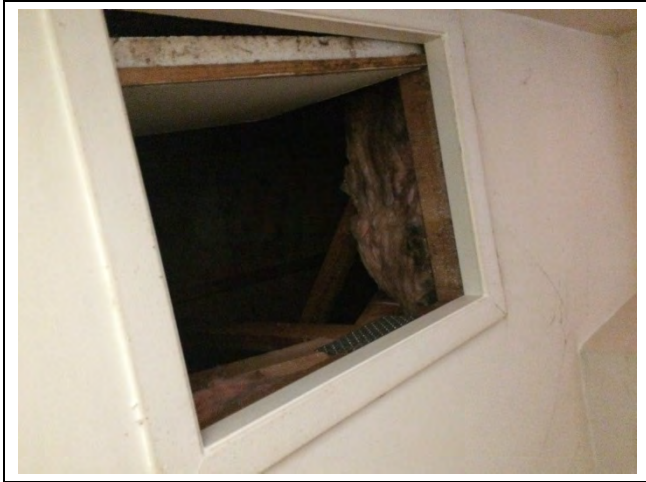
Photo 1: Asbestos-containing drywall joint-fill compound observed on walls and ceilings at Unit F.

Appendix D Selected Site Photographs February 15, 2017