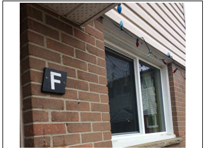
Photo 4: Presumed asbestos-containing brick mortar was observed on exterior walls at Unit F.