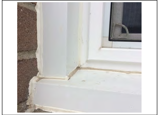
Photo 2: Presumed asbestos-containing exterior window caulking at Unit F.