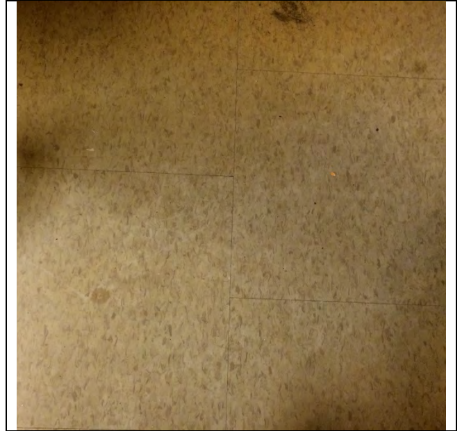
Photo 2: 12"x12" vinyl floor tile – beige with grey specks identified to be asbestos-containing in Unit 207 (2.22% Chrysotile).