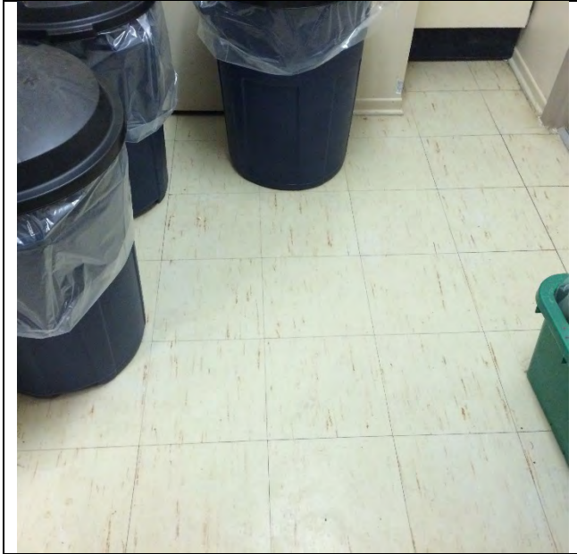
Photo 1: 12"x12" vinyl floor tile – beige with brown streaks identified to be asbestos-containing (2.23% Chrysotile).

Appendix D Selected Site Photographs February 15, 2017