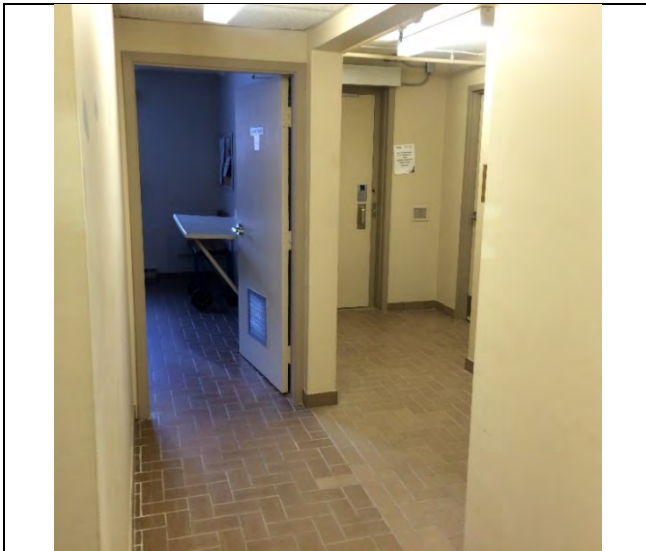
Photo 3: Drywall joint-fill compound identified to be asbestos-containing in the hallways (1% Chrysotile).