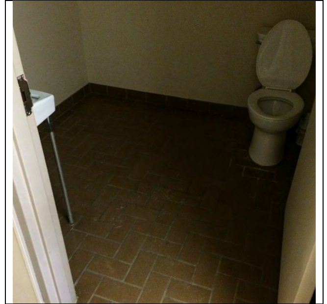
Photo 6: Ceramic tile grout and mortar/adhesive are presumed to be asbestos-containing in the washroom.