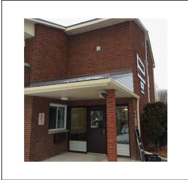
Photo 5: Exterior and interior door caulking is presumed to be asbestos-containing.

Appendix D Selected Site Photographs February 15, 2017