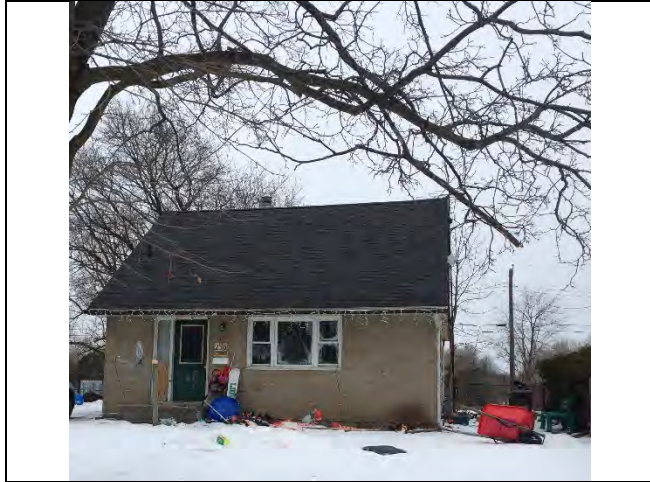
Photo 1: Presumed asbestos-containing brick mortar, roofing materials and roof caulking.

Appendix D Selected Site Photographs February 16, 2017