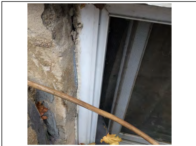
Photo 3: Presumed asbestos-containing exterior window caulking – white observed on exterior windows.