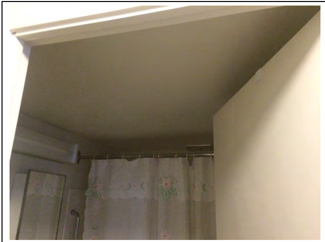
Photo 3: Drywall joint-fill compound identified to be asbestos-containing in Unit 203 (1% Chrysotile).