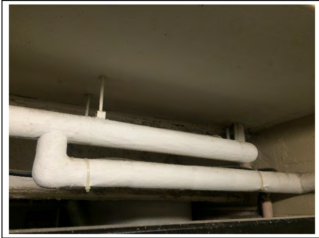
Photo 1: Insulating cement on pipe fittings identified to be asbestos-containing in the first floor garbage room (50% Chrysotile).

Appendix D Selected Site Photographs February 14, 2017