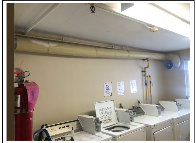
Photo 2: Corrugated paper-like straight pipe insulation identified to be asbestos-containing in the first floor laundry room (65% Chrysotile).