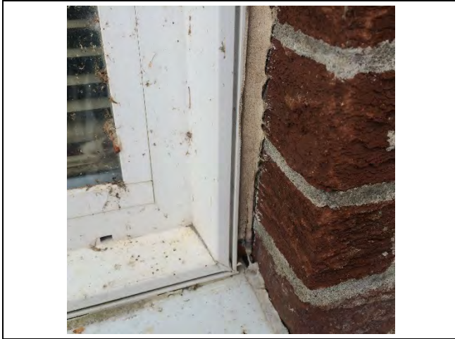
Photo 5: Exterior window caulking – white is presumed to be asbestos-containing.

Appendix D Selected Site Photographs February 14, 2017