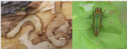
Picture 2. Emerald Ash Borer Larva in Gallery and Adult

In an effort to find a solution to protect high value ash trees from damage by EAB, the potential of TreeAzin was assessed by determination of: