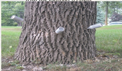
Picture 1. TreeAzin Injection of an Ash Tree with the EcoJect System

In 2002, the emerald ash borer ( Agrilus planipennis ) (EAB) (Picture 2), an invasive woodborer from China, was discovered in Windsor, Ontario, Canada. This serious pest has killed millions of native ash ( Fraxinus spp ) trees in both Canada and the USA.