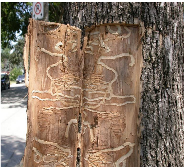
Figure 4 S-shaped larval galleries.

Symptoms of EAB attack include tree decline, crown thinning and the appearance of epicormic branches (new shoots growing from the trunk or main branches, often in clumps). Other symptoms include vertical cracks in the bark created from larval tunnelling.