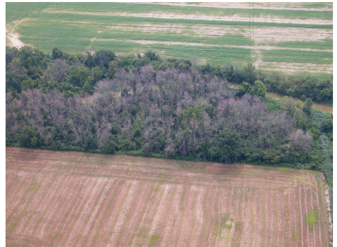
Figure 1 Woodlot damaged by emerald ash borer.

EAB is well suited to our climate and ash species. It is hoped that over time natural ecosystem controls, such as parasites or disease, will help regulate the beetle's population and reduce its impact.