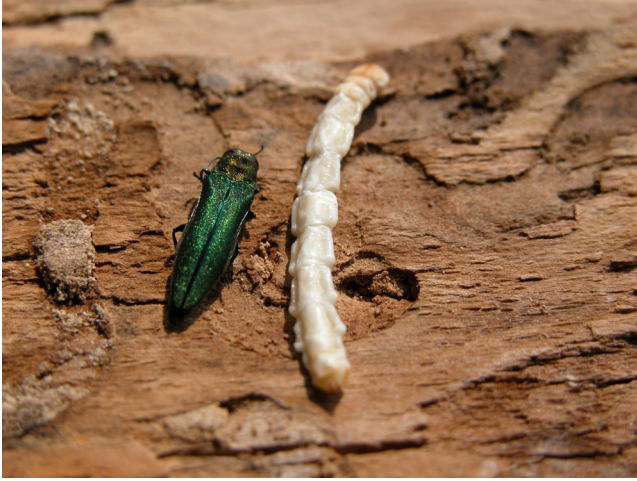
Figure 2 Emerald ash borer adult and larva.

the bark that are 3.5 to 4.1 mm wide. Feeding by adult beetles on foliage creates a jagged or notched edge to leaves.