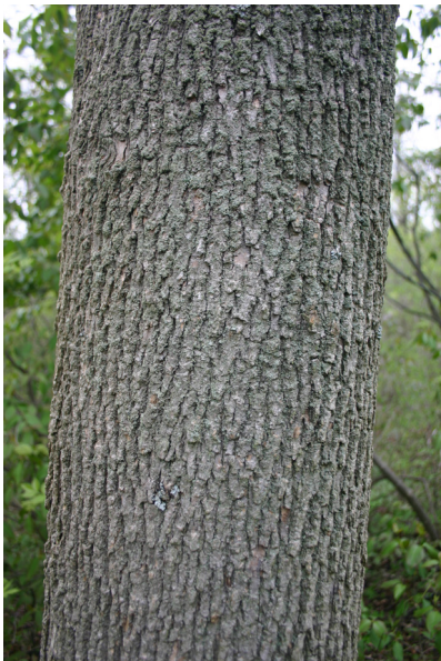
Figure 7 Red ash bark.

Bark is furrowed or scaly, often with ridges in a diamond-shaped pattern on mature trees (Figure 7).