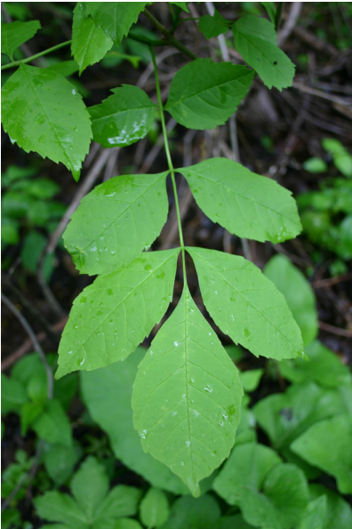
Figure 6 Red ash leaf.