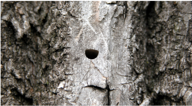
Figure 3 D-shaped exit hole created by adult emerald ash borer.